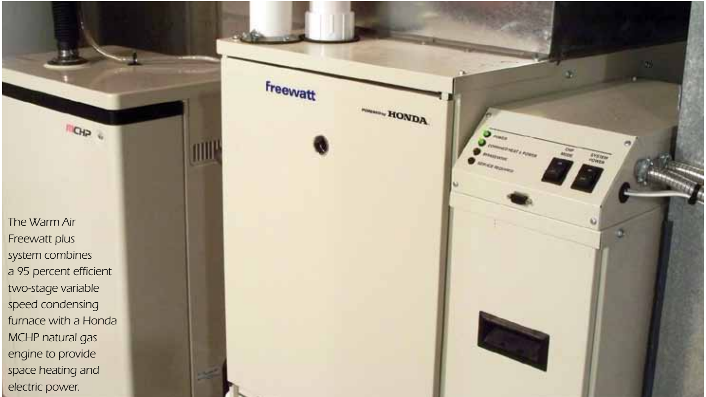
The Warm Air Freewatt plus system combines a 95 percent efficient two-stage variable speed condensing furnace with a Honda MCHP natural gas engine to provide space heating and electric power.

the processor generates electricity with hot water as a byproduct.