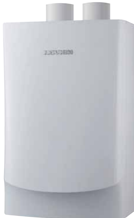
Navien tankless gas water heater.