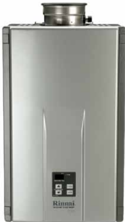
Rinnai America Corporation's R75LSi tankless unit.

Aside from the enormous amounts of space these units save, combination systems are extremely easy to use and generally rely only on a regular thermostat to regulate the home's indoor air temperature, so