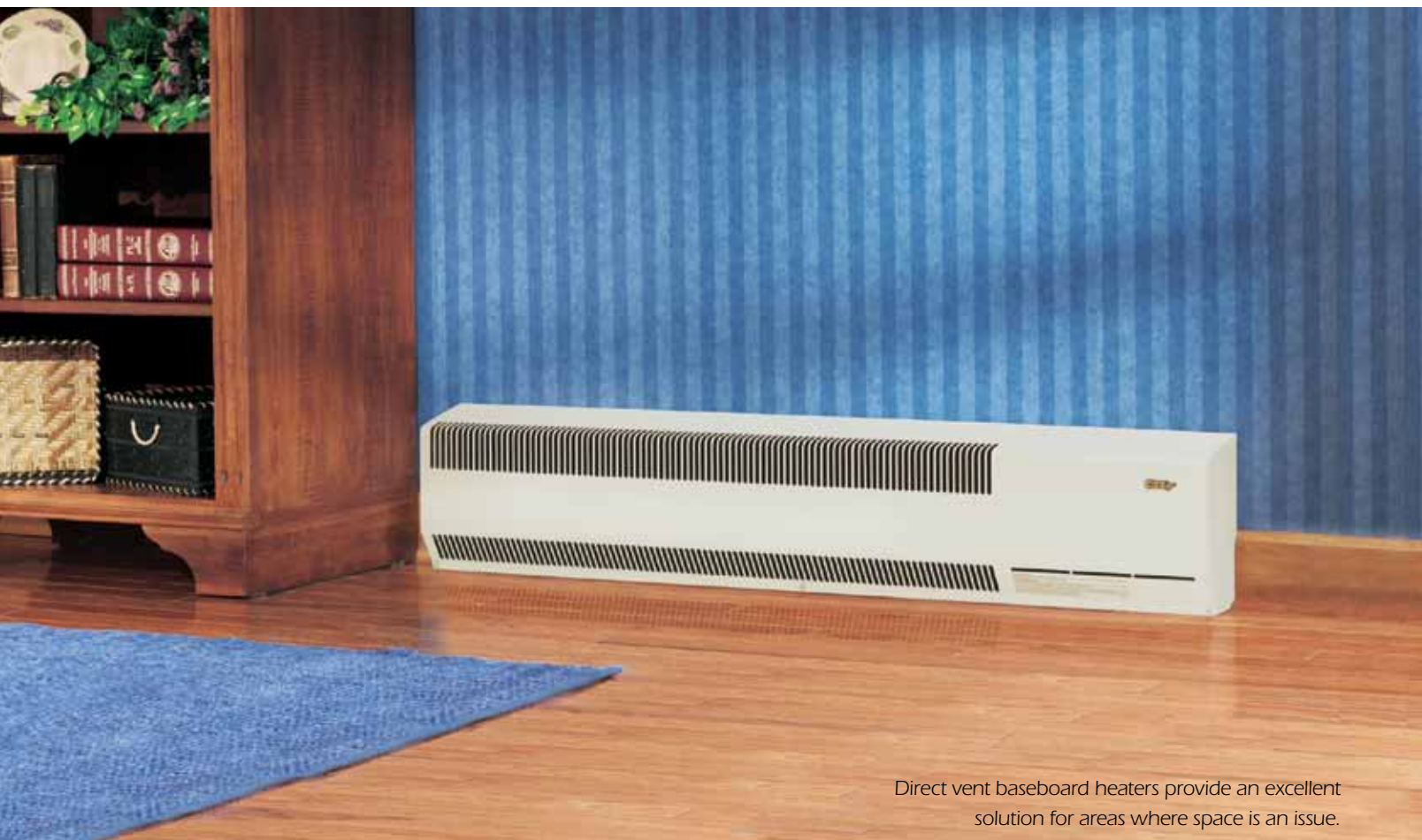
Direct vent baseboard heaters provide an excellent solution for areas where space is an issue.

heat source for areas prone to nuisance outages, Davis said, noting that direct vent heaters are also good for garages.