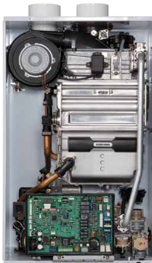
Inside look at a Navien tankless water heater.